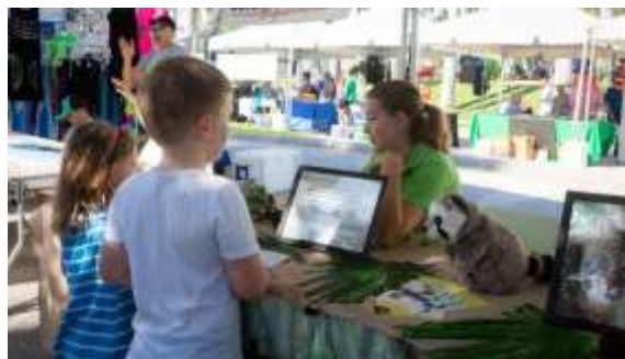
An owl encounter_ The Busch Wildlife Sanctuary