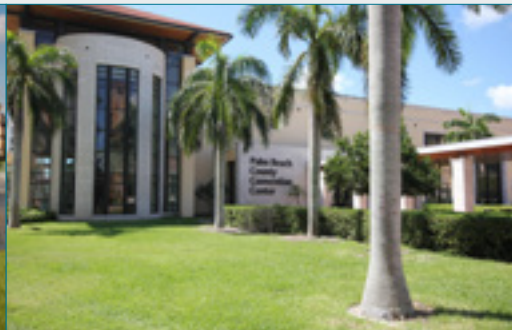
Palm Beach County Convention Center