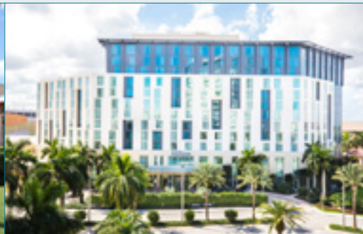
Hilton West Palm Beach

Palm Beach County is the first destination in the U.S. to have its airport, convention center, and convention center hotel receive the Global Biorisk Advisory Council's (GBAC) STAR™ accreditation.