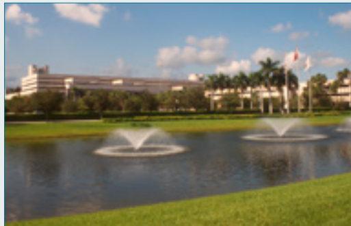
Palm Beach International Airport